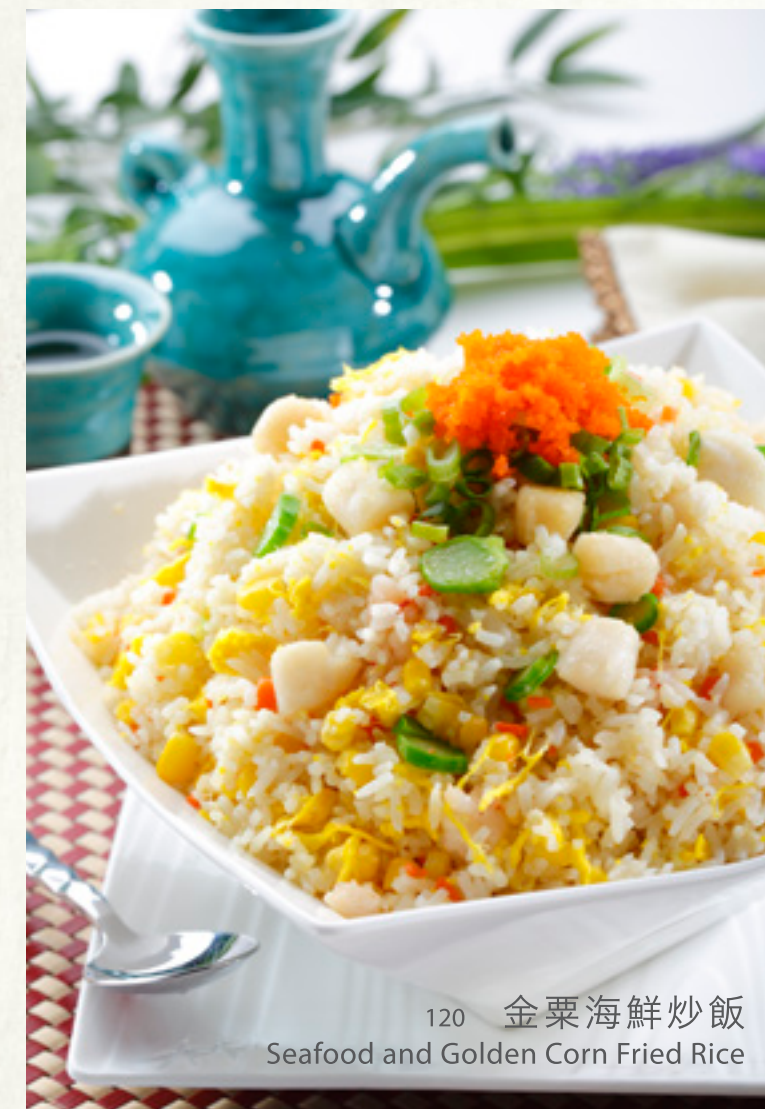
120 金粟海鮮炒飯 Seafood and Golden Corn Fried Rice