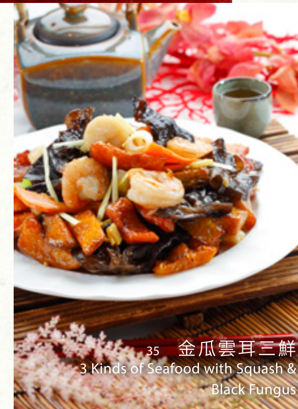
35 金瓜雲耳三鮮 3 Kinds of Seafood with Squash & Black Fungus