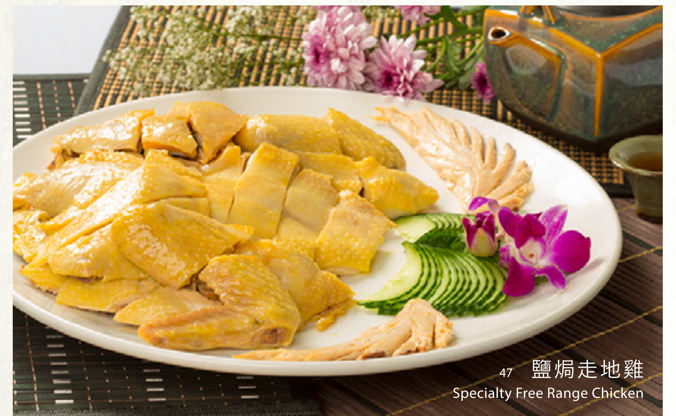
47 鹽焗走地雞 Specialty Free Range Chicken