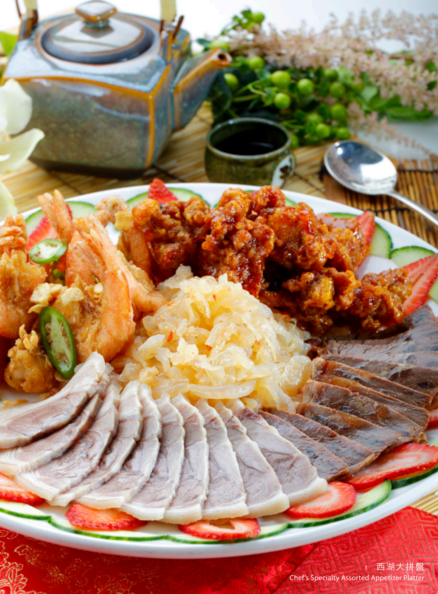
1 西湖大拼盤 Chef's Specialty Assorted Appetizer Platter