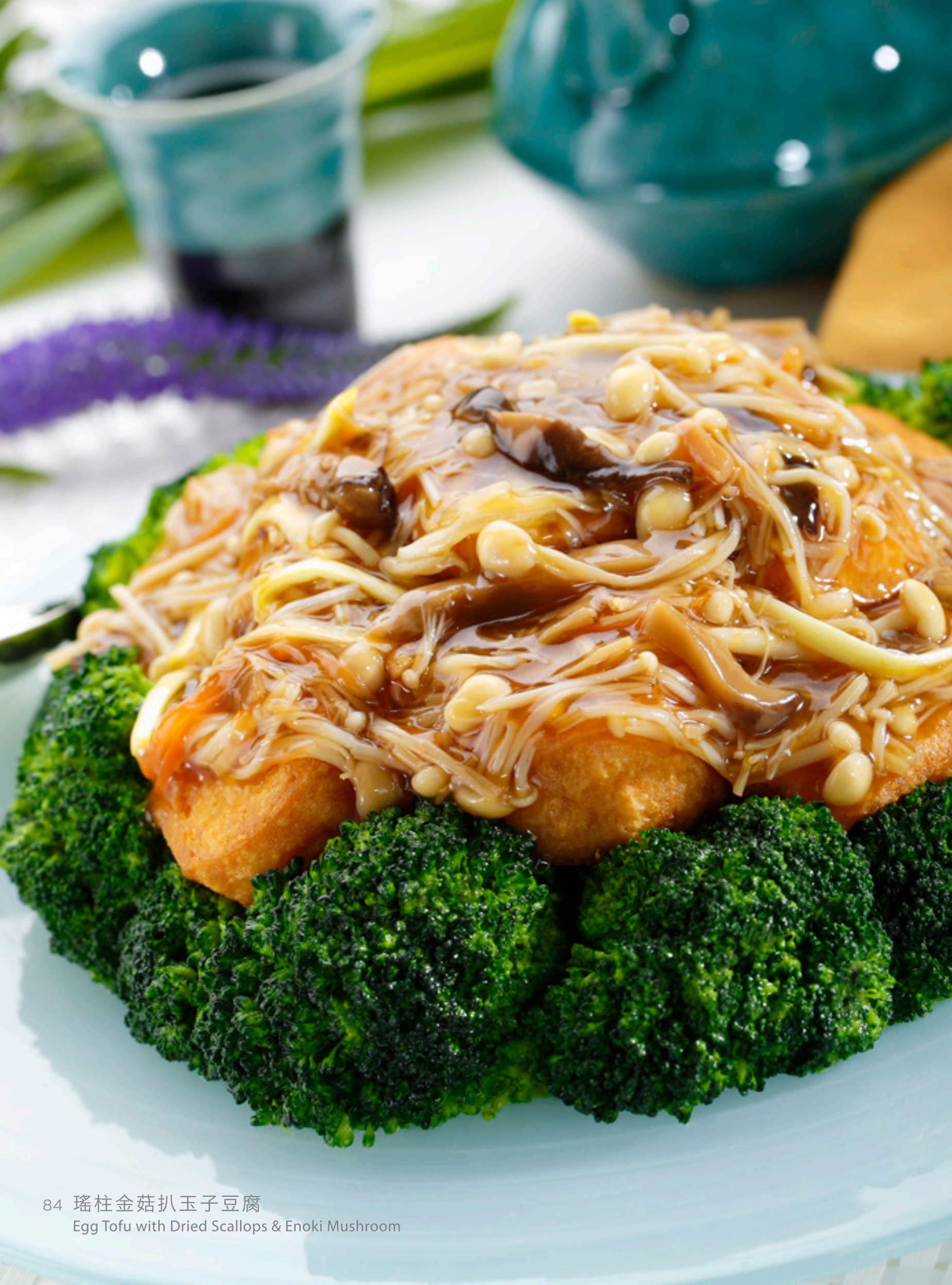
84 瑤柱金菇扒玉子豆腐 Egg Tofu with Dried Scallops & Enoki Mushroom