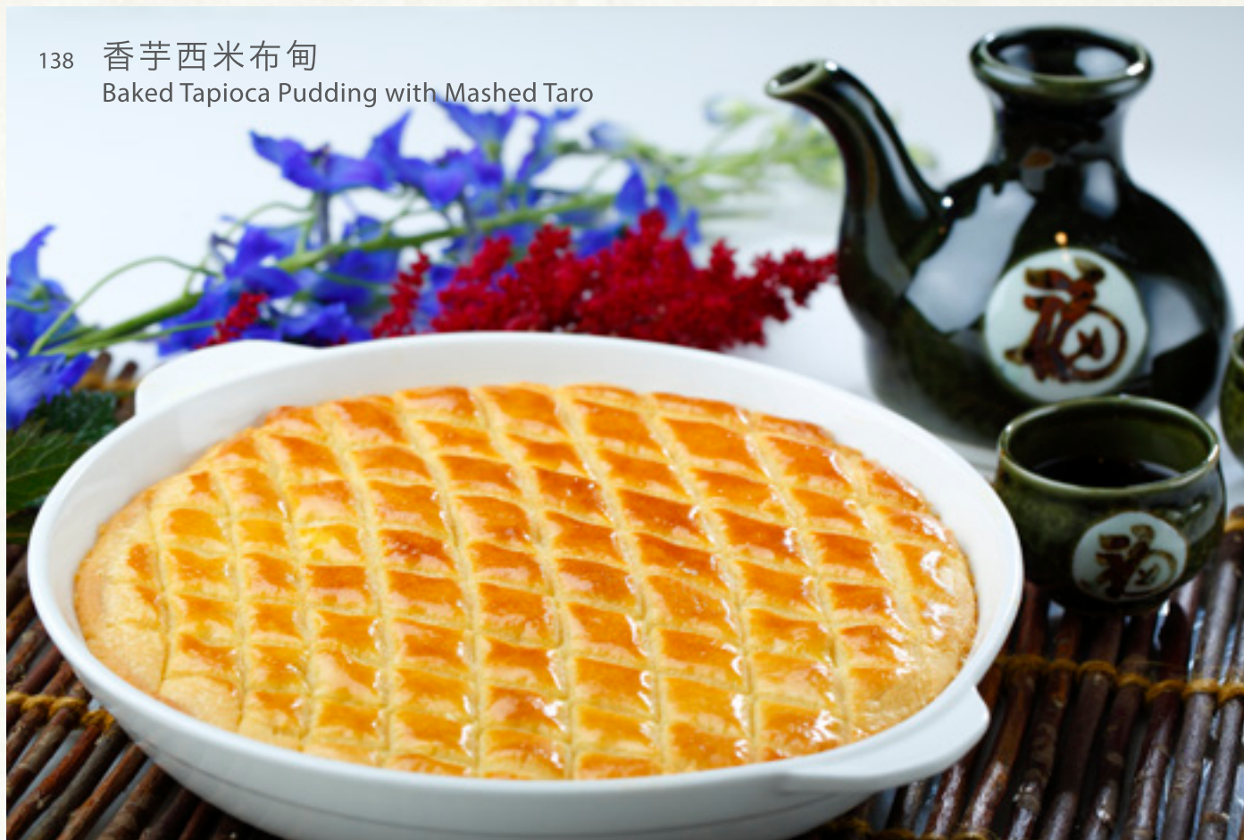
138 香芋西米布甸 Baked Tapioca Pudding with Mashed Taro