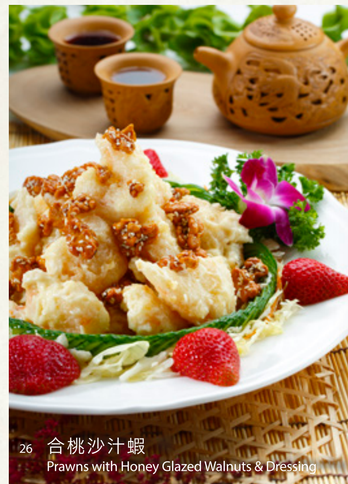
26 合桃沙汁蝦 Prawns with Honey Glazed Walnuts & Dressing