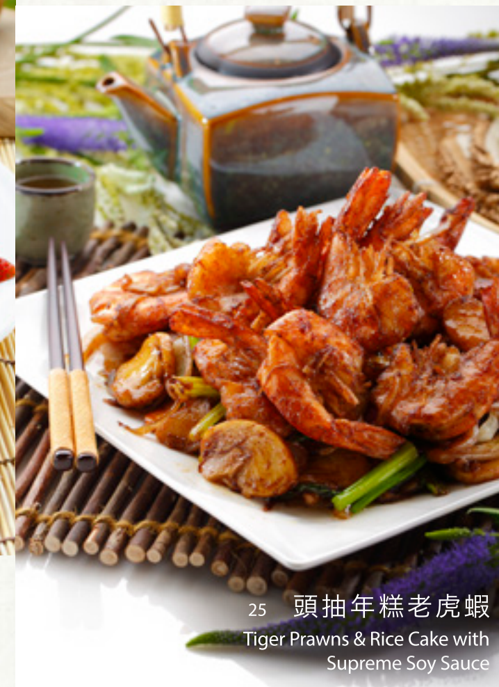
25 頭抽年糕老虎蝦 Tiger Prawns & Rice Cake with Supreme Soy Sauce