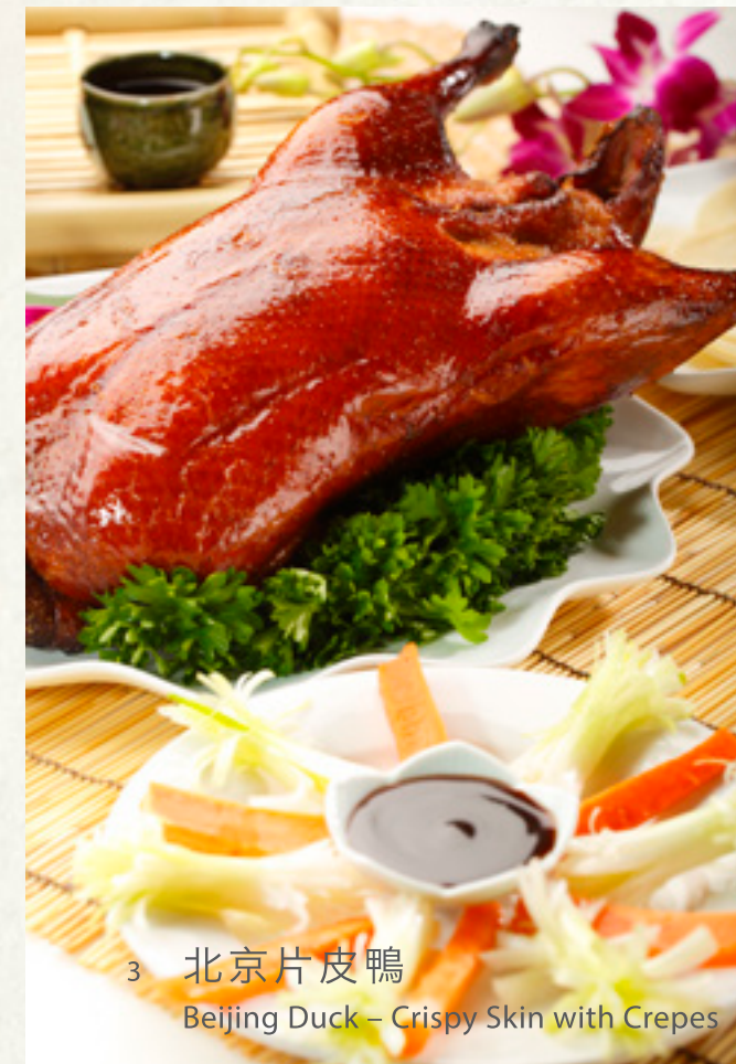
3 北京片皮鴨 Beijing Duck – Crispy Skin with Crepes