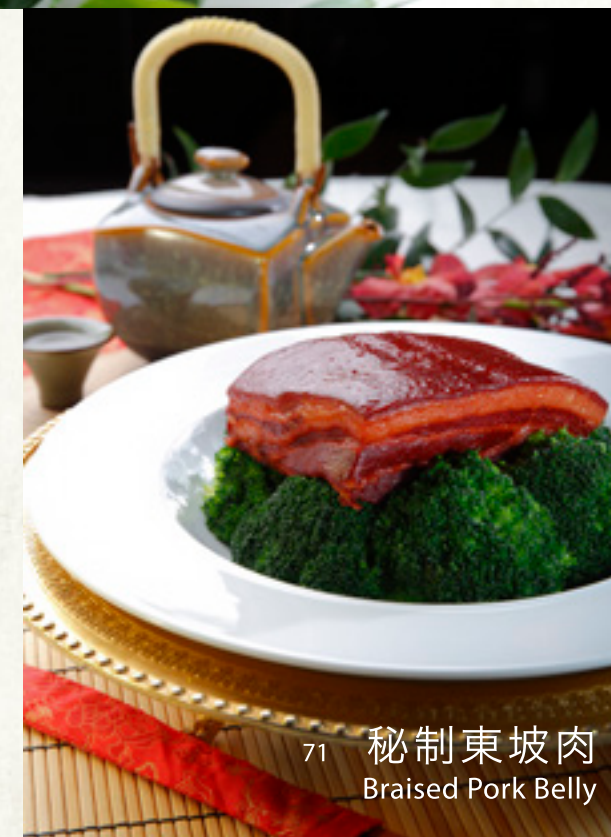
71 秘制東坡肉 Braised Pork Belly