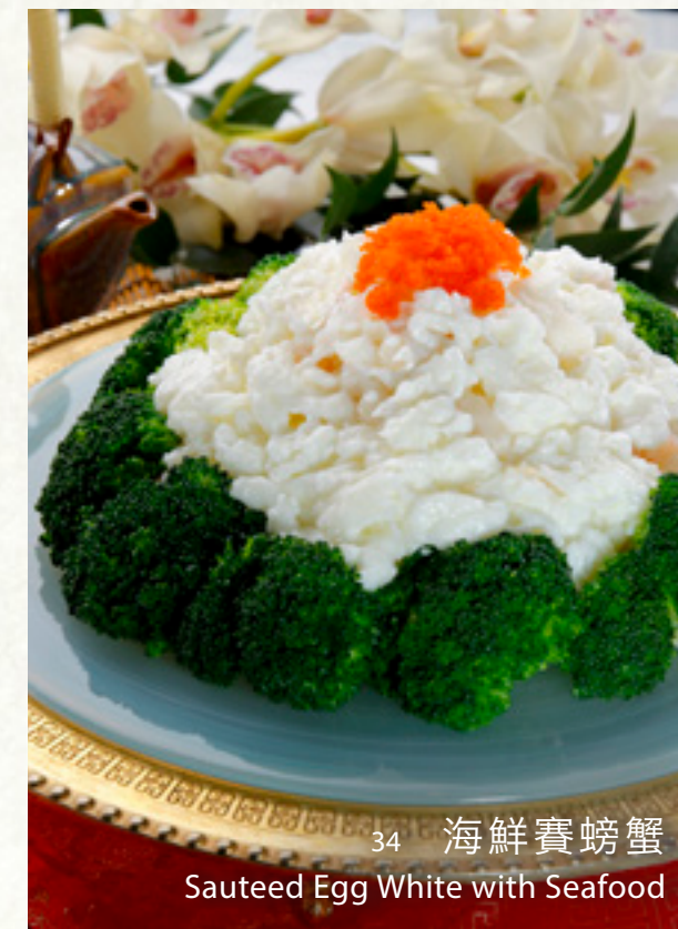
34 海鮮賽螃蟹 Sauteed Egg White with Seafood