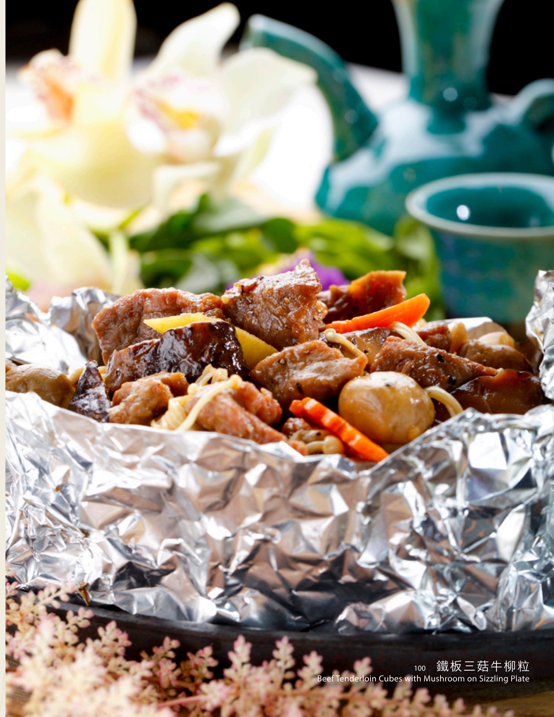
100 鐵板三菇牛柳粒 Beef Tenderloin Cubes with Mushroom on Sizzling Plate