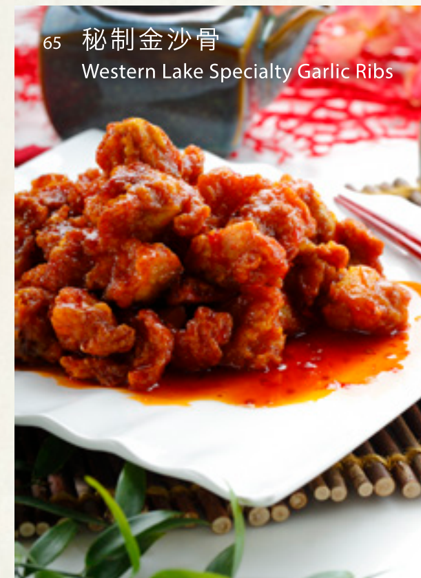
65 秘制金沙骨 Western Lake Specialty Garlic Ribs