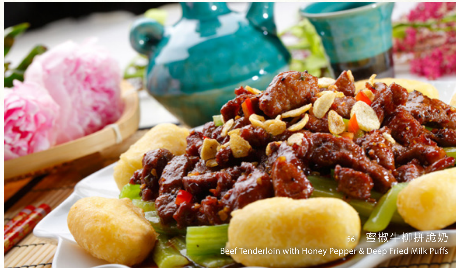
56 蜜椒牛柳拼脆奶 Beef Tenderloin with Honey Pepper & Deep Fried Milk Puffs