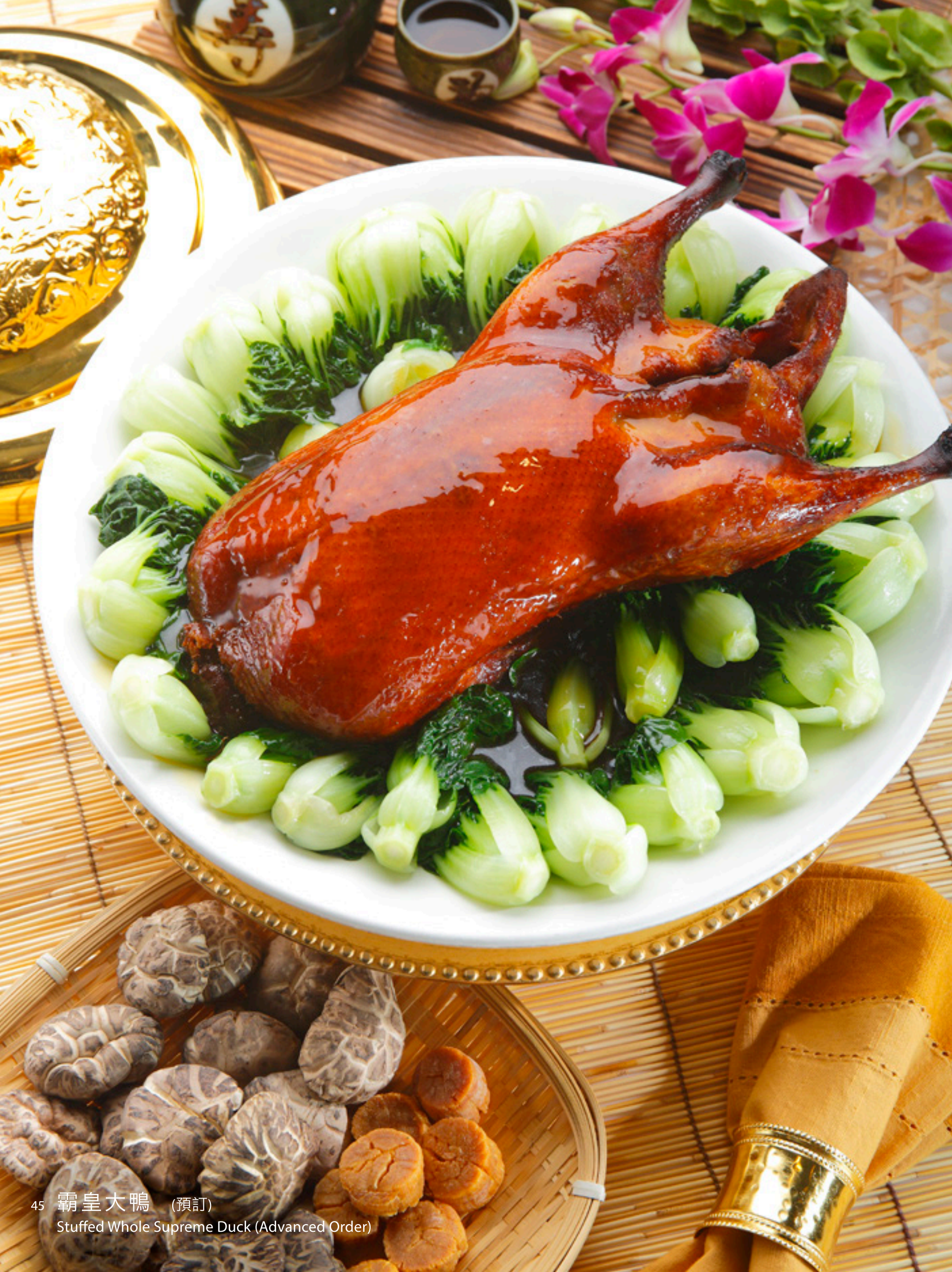
45 霸皇大鴨 (預訂) Stuffed Whole Supreme Duck (Advanced Order)