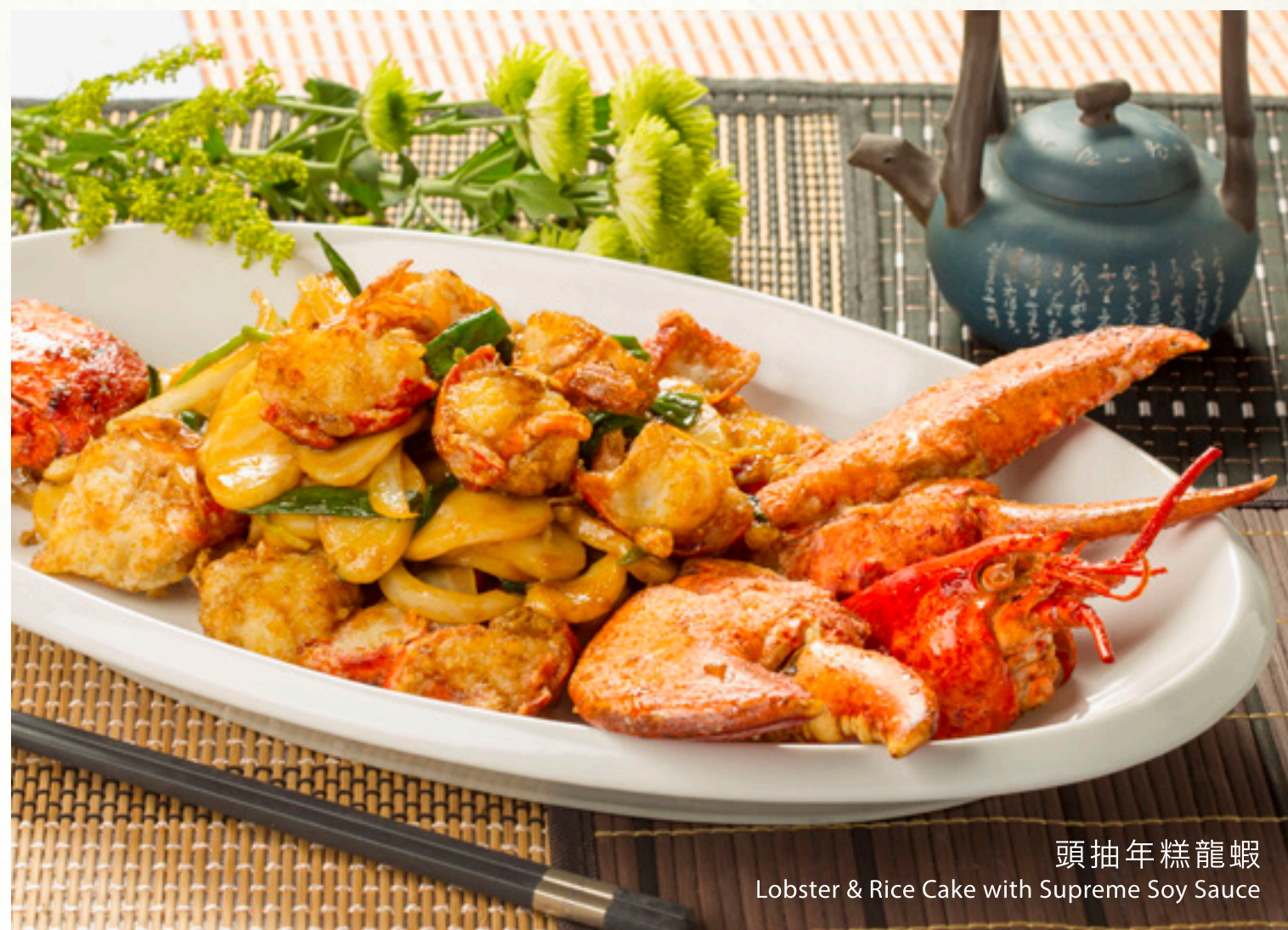
頭抽年糕龍蝦 Lobster & Rice Cake with Supreme Soy Sauce

(Supreme Soy Sauce & Bedded with Rice Cake is $13 Extra, Salted Egg is $8 Extra)